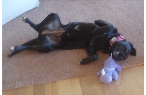
Silly Gracie with beloved purple rhino

People and dogs, if you want to try READ to ROVER be brave and do it. It's not for everyone but it's fun for many of us and the kids will love you. You'll hear some great stories too.