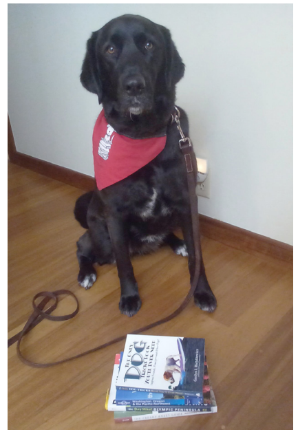
Rover dog, Gracie

I was sick of traveling but it wasn't over yet. After a chance to walk around, stretch my legs and do my business I was led over to a pickup truck and invited to "hop in." "Hop in" is an instruction that I now love as it usually means a fun adventure including our weekly trip to school for READ to ROVER. But that day? Nope, no and no again. I was not getting into that truck. Finally, Dad hefted all 70 pounds of me into the truck and with an additional boost from Mom the door closed and we were on our way. The truck was very comfortable and soon I was asleep and did not wake up until we pulled into the garage of my new home.