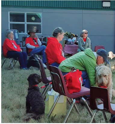
Celebrating a community of volunteers, teachers, school staff and second grade readers

Thank you notes were created by kids and delivered to their favorite dogs