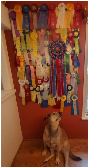
My Ribbon Wall