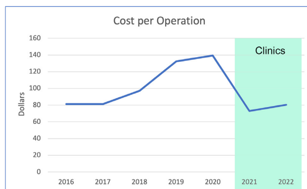
Costs of spay / neuter operations in recent years. 2020 and earlier are under the old vet voucher model.