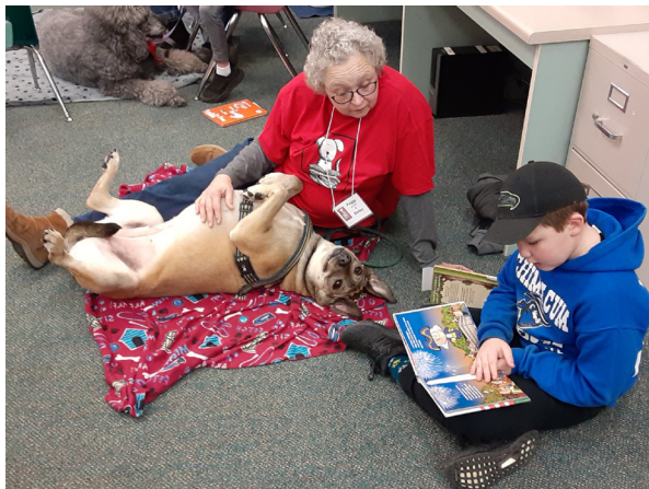
Listening is so relaxing at READ to ROVER