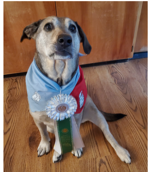
The many hats (scarves) of Bailey