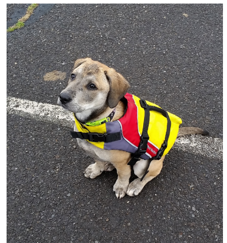
As a puppy, ready to kayak