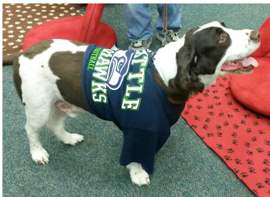
My Master and I are Sports Fans

I really love R2R just as much as I love going for walks with my Master and Mistress and I would encourage any other canines to suggest to their owners to ask for information on this program that so benefits the kids in our community as well as the owner handlers.....just ask any of them.