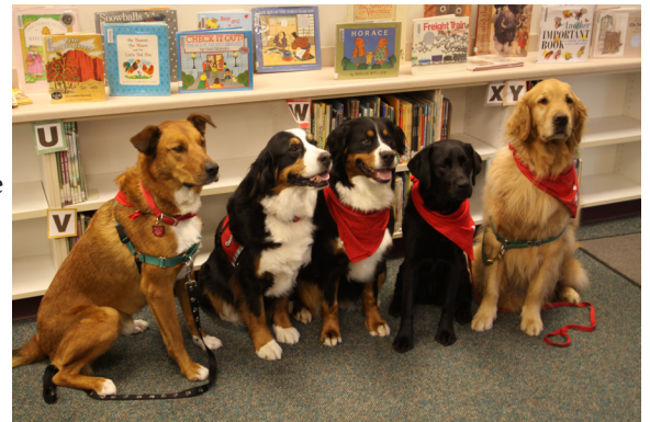
The dogs in the first year of Chimacum Creek Read to Rover, Rudy, Liberty, Onyx, Raven, and Sunny