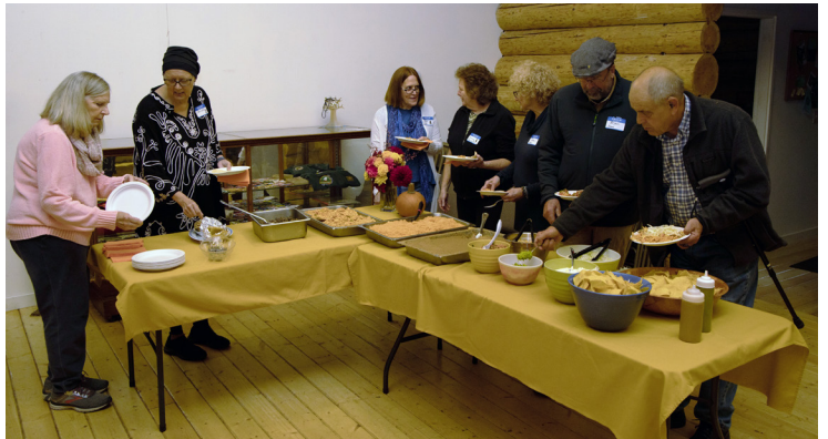
Lots of good food

On Saturday October 19 th , Pet Pals hosted a party to show our appreciation for all the great things our volunteers do in the community. The human members of our active therapy dog teams who visit assisted living homes in our Pets to People program and help kids learn to love reading in our Read to Rover program were invited. It was held at the charmingly rustic Fred Lewis Boy Scout Cabin. The event involved lots of warm and wonderful conversations, good food from San Juan Taqueria, yummy desserts, and attractive door prizes. Thanks again to all our volunteers for contributing their time and energy and for sharing their dogs with the many lives they touch.