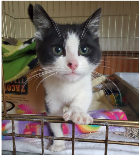
One of three kittens happy to be on his way to a better life.