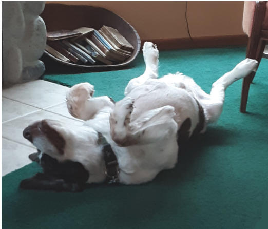
The non-hunting life is the life for me

M y friend, and Read To Rover buddy, Lumie, said that I should introduce myself.... Well, my name is Daniel the Spaniel , and I am a 55 pound, liver and white, English Springer Spaniel. My name comes from the fact that I naturally “spring” at game and flush them out of the tall grass for the hunters. My breed was officially named by the 1902 British Kennel Club, but spaniels have been recognized for over 300 years. Although I am bred to hunt birds, I personally love birds and won’t even chase the