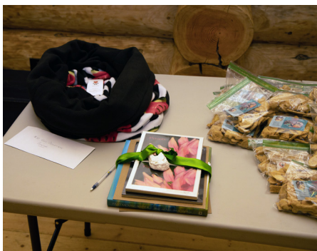
Raffle prizes (Bonita's gift card, Keith Lazelle photo items, Creature Comforts dog bed) and Gathering Place treats for all