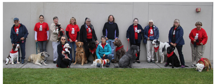
The program has grown to 19 regular teams and a host of active subs. These were the 2018 teams.