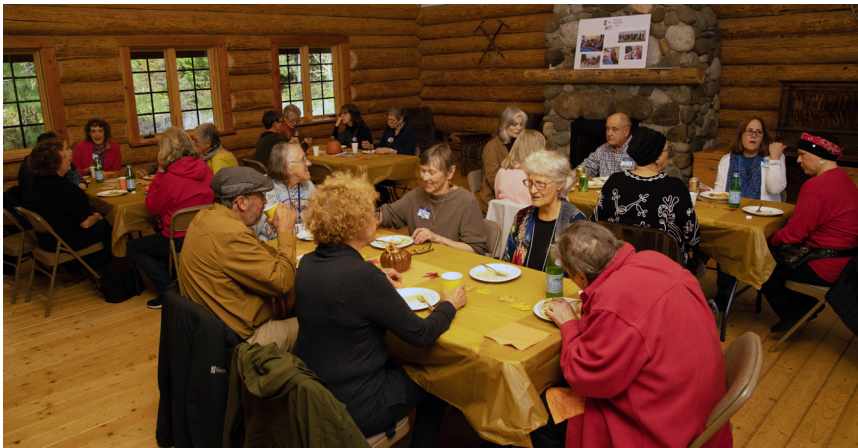
A gathering of heroes at the Boy Scout Cabin