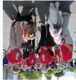
Teams from Chimacum Creek