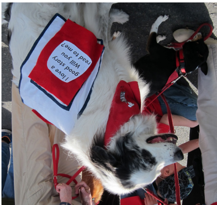
Otis asks you to read to him

It has become an annual tradition for our READ to ROVER teams to march in the Pet Parade during Port Townsend's Rhody Festival with our student READers from Grant St. Elementary and Chimacum Creek Primary schools.