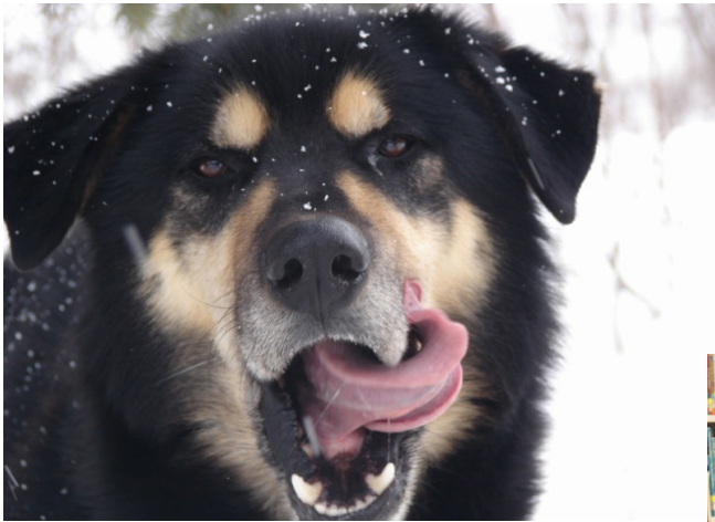
Then: Tonzo enjoying the Alaskan snow