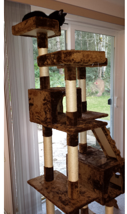
Bella at home