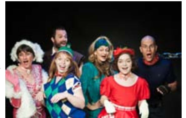
Through our collaboration with local arts organizations, we've been able to offer special events like Bark!, The Musical which was a partnership with Key City Public Theater

It's an all-around win. Our programs have introduced new audiences to local arts organizations, while allowing us to put on extraordinary fundraisers. This year, our efforts were recognized by the Port Townsend Friends of the Arts, which awarded us a $5,000 grant to support and enhance these and other cultural events. The funds will allow us to create more programs that highlight our local artists and arts organizations while helping us achieve our core mission to reduce pet homelessness.