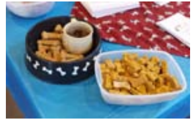
Yummy homemade dog treats