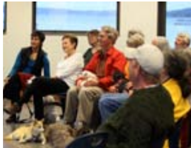
Audience enjoyment

Highlights of the program included the thoughts of Henri, le Chat Noir, poems by Shakespeare's cat, Longfellow's cat, Elizabeth Barrett Browning's cat, and Kipling's cat, and dog stories by Mary Oliver and James Herriot. Human and canine guests snacked on homemade cookies and we provided takeaway treats for stay-at-home cats.