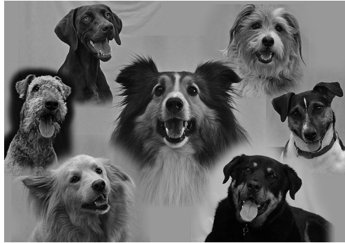
Poster dog Shelby Gast and five runners up

all the fabulous dogs who participated in the contest on our website, www.ompetspals.org