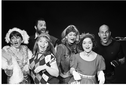
Cast of BARK! The Musical

Prior to the production, Pet Pals launched a Poster dog contest. Photographers Deb Hammond and Sheila Lauder spent two days taking photos of over 40 dogs who vied for the honor of appearing as BARK’s poster dog. Shelby Gast, a handsome Sheltie, won the coveted spot. You can see a slide show of